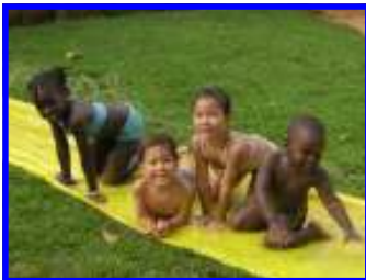
Fun in the backyard. ↓